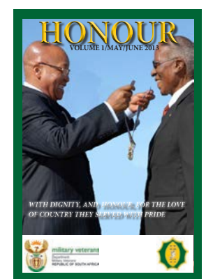
Honour 1st Edition

Budget Vote Speech by Hon Minister Mapisa-Nqakula The Deputy Minister of Defence and Military Veterans Thabang Makwetla, and the Director General of the Department of Military Veterans(DMV) Mr T Motumi Addressed the National Executive Committee(NEC) of the South African National Military Veterans Association(SANMVA) .....10 CONTACT DETAILS Honouring and Memorialising Fallen Military Veterans......11 Honouring Military Veterans Through Medal Parade...... 12 and 13 Tribute from Advocate Ntsaluba .....14 Military Veterans Act.....15