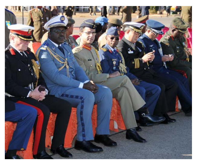
Defence Attaché s witnessing the parade